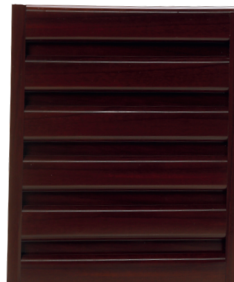
BROW WALNUT WOOD