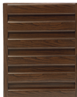
CHERRY WOOD NATURAL